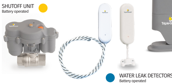
WATER LEAK DETECTORS Battery operated