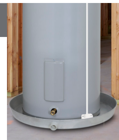
← Battery operated