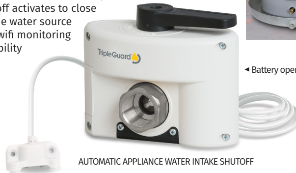
AUTOMATIC APPLIANCE WATER INTAKE SHUTOFF