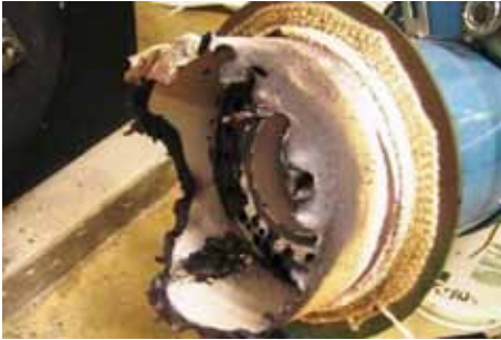
The burner head was destroyed because the boiler was oversized and stayed at low fire for an extended period.

If we have a 10-to-1 turndown burner, the jacket loss percentage just jumped to 30% of the firing rate. The boiler efficiency is now at 56%.